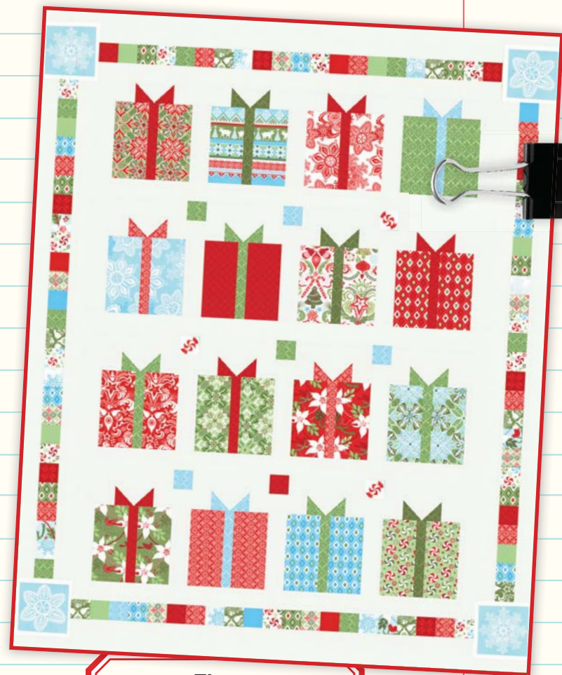
Flurry Quilt measures 57" x 67" PS27080