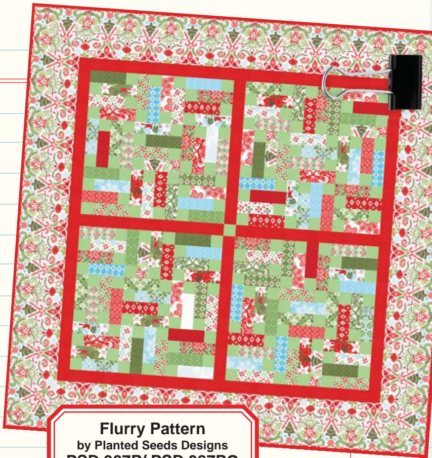
Flurry Pattern by Planted Seeds Designs PSD 387P/ PSD 387PG