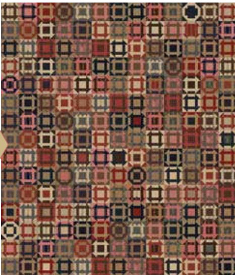
RQC 142 / RQC 142G Haimish Size: 65" x 75"