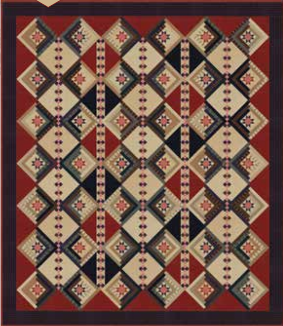
PS38020 Timeless Size: 70.5" x 81"

I'm a traditionalist at heart, and to my core. This group is a wonderful combination of my favorite old colors – blue and indigo, tan and brown, rusty red and muted pink. Just as time moves forward, I like to think that my collections keep building, mixing with the old and anticipating the new fabrics still to come.