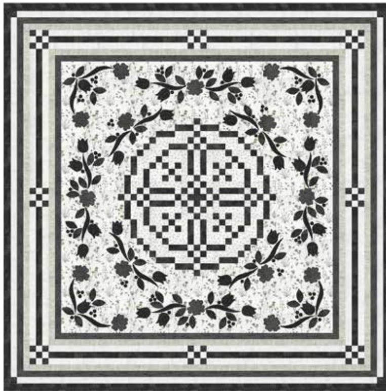
JC 213 Constance 61" x 61"