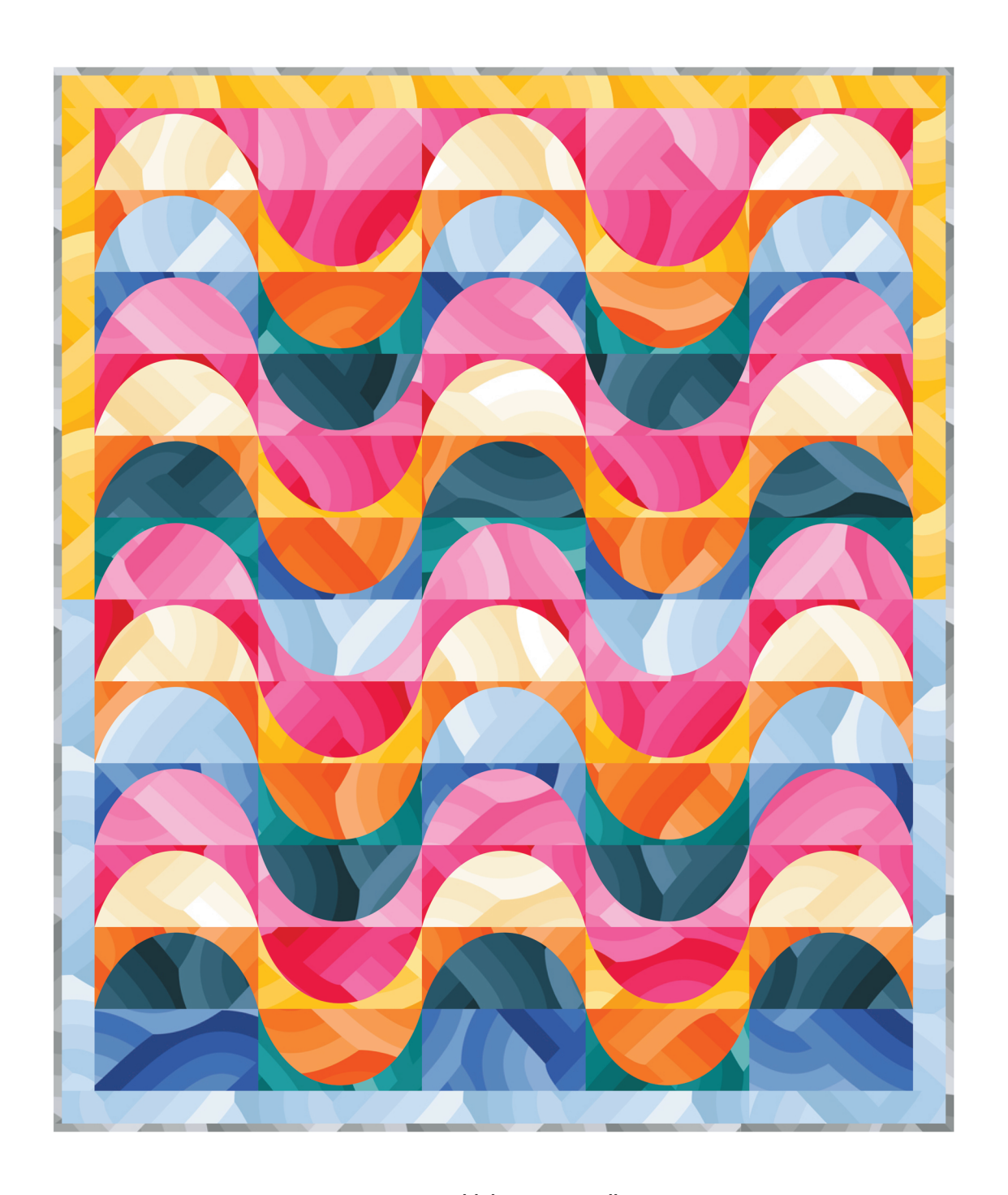
WEB PATTERN I Think You're Swell 54" x 64"