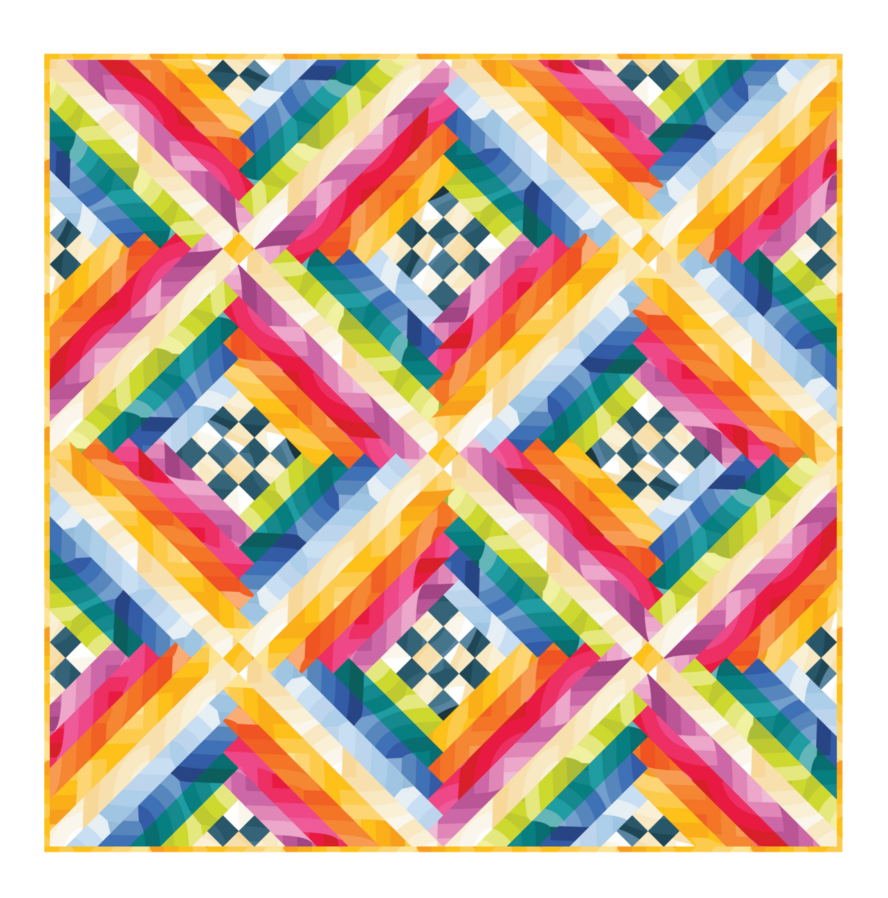
PS42380 Courthouse Checks 71" x 71"