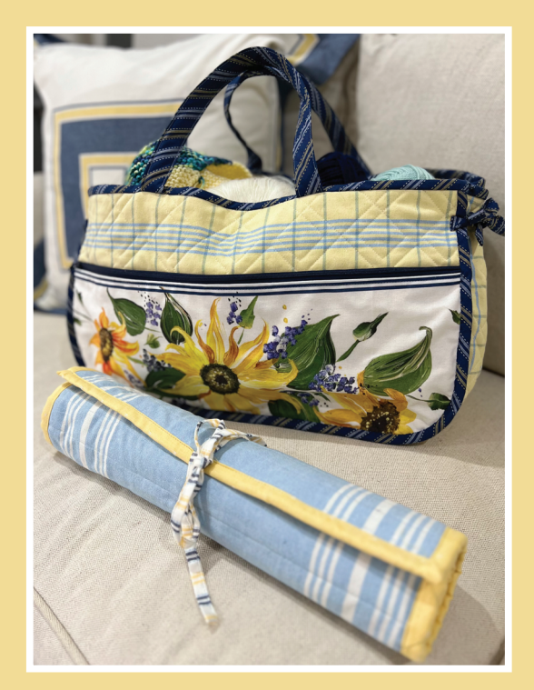
PTT 283 Knit Happens Needle Roll 24" x 16" Knitting Bag 18" x 11" x 9"