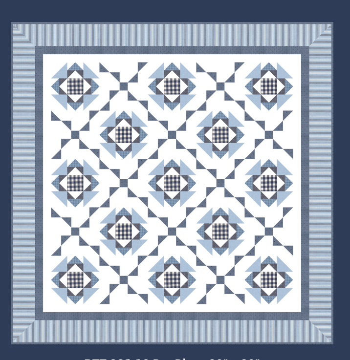
PTT 281 12 Bar Blues 80" x 80"