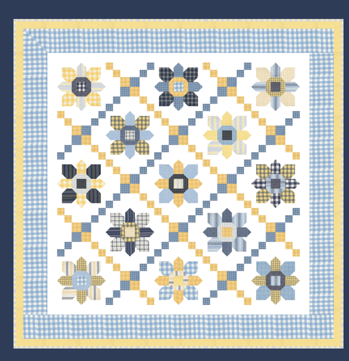
PTT 279 Woven Blooms 68" x 68" LC Friendly Also available in a dark colorway