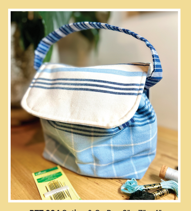
PTT 284 Gather & Go Bag 8" x 7" x 4"