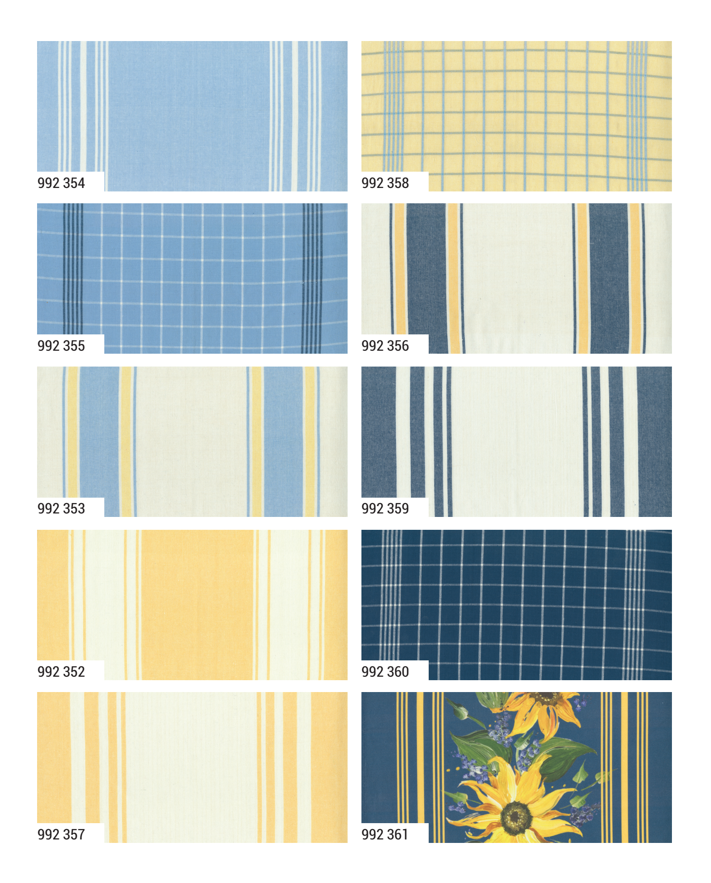
992 •12 18 Inch Wovens •100% Premium Cotton Toweling MARCH DELIVERY