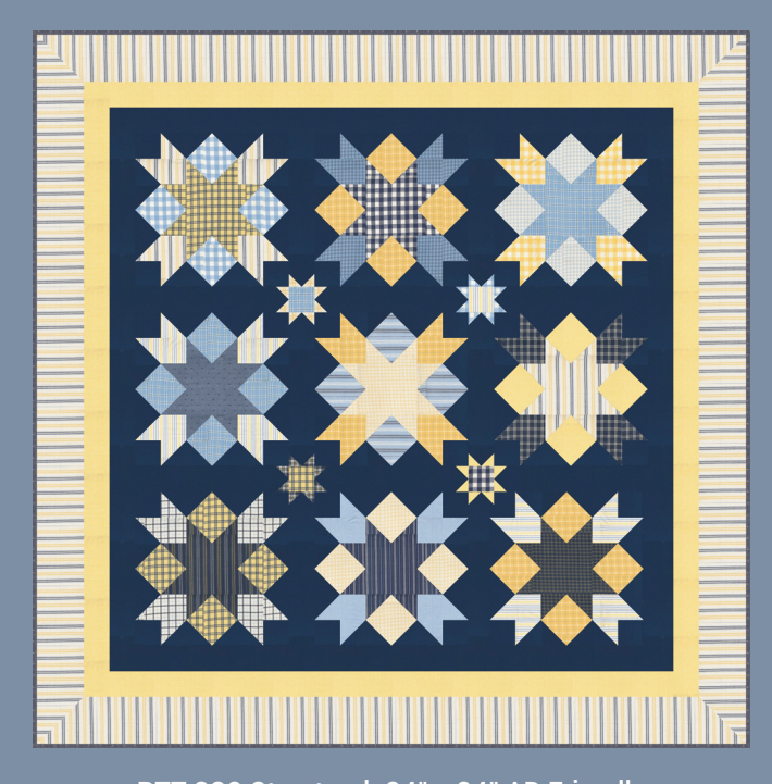
PTT 280 Starstruck 84" x 84" AB Friendly