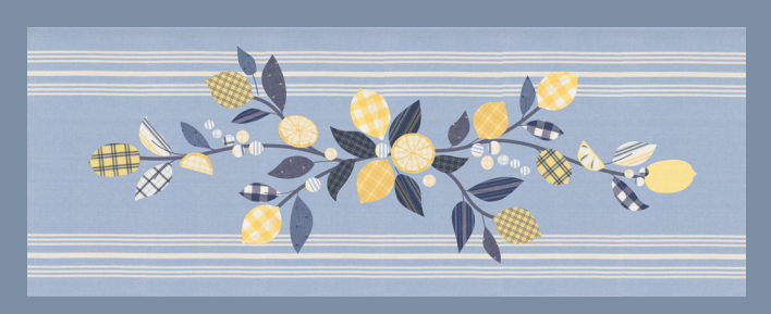
PTT 282 Limoncello Spritz 50" x 18" PP Friendly Additional colorways available