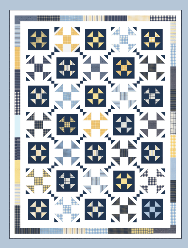
PTT 277 Nocturne 61" x 81" LC Friendly