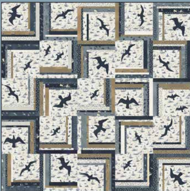
JC 217 On The Wing 50" x 50" JR Friendly