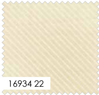
FIG TREE CREAM 9900 67