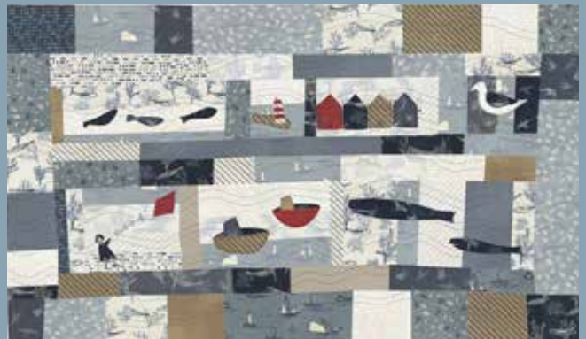
JC 128 Down By The Seaside 27" x 14"